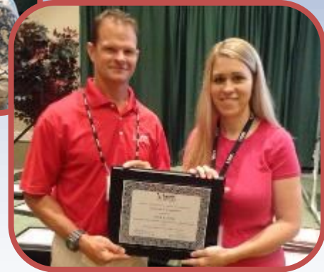
Hanley Hills ● New London ● Kennett ● St. James